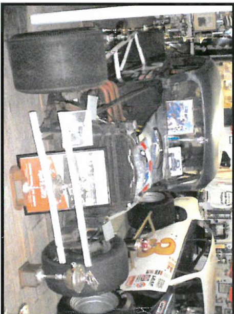
Len Boehler's "Ole Blue" on display.

New England's Only Museum Dedicated to Auto Racing History